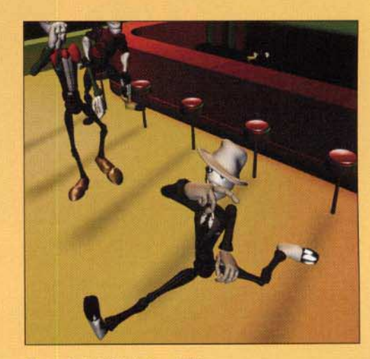
Figure 2: (void*): A Cast of Characters