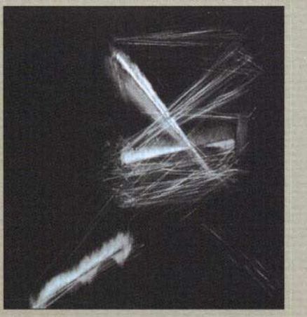
Figure 7: Loops

and lighting control help reveal the emotional content of each scene.