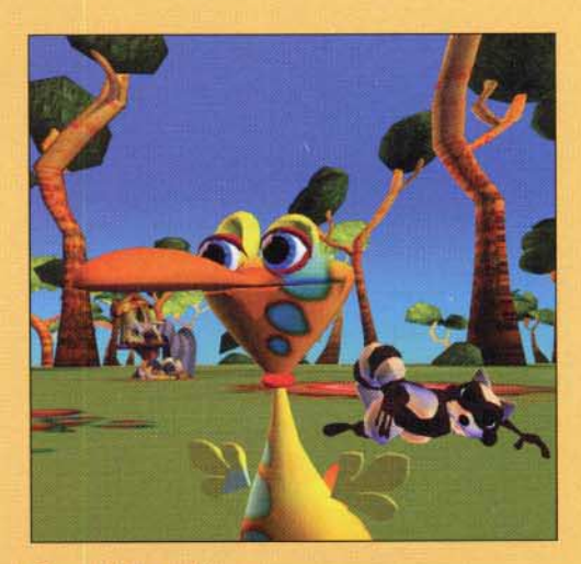
Figure 1: Swamped!

Our first group installation, Swamped!, is an interactive experience in which an instrumented plush toy provides a tangible, iconic interface for directing autonomous animated characters [1]. By manipulating a stuffed animal (a bright yellow chicken) corresponding to a chicken onscreen, the participant influences how the virtual character behaves. In addition, a fully autonomous raccoon, hungry to eat the chicken's eggs, completes the barnyard scene. Each character has a distinct personality and decides in real time what it should do based on its perception of its environment, its motivational and emotional state and input from the participant. The characters incorporate a new model of behavior and emotion, a new multi-target motion interpolation and new techniques for real time graphics. Automatic camera