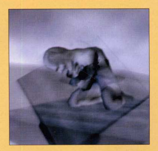
Figure 3: sand:stone